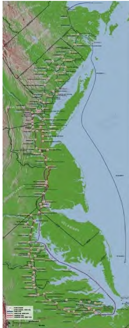
Map shows the route from Concord, MA to Yorktown, Virginia