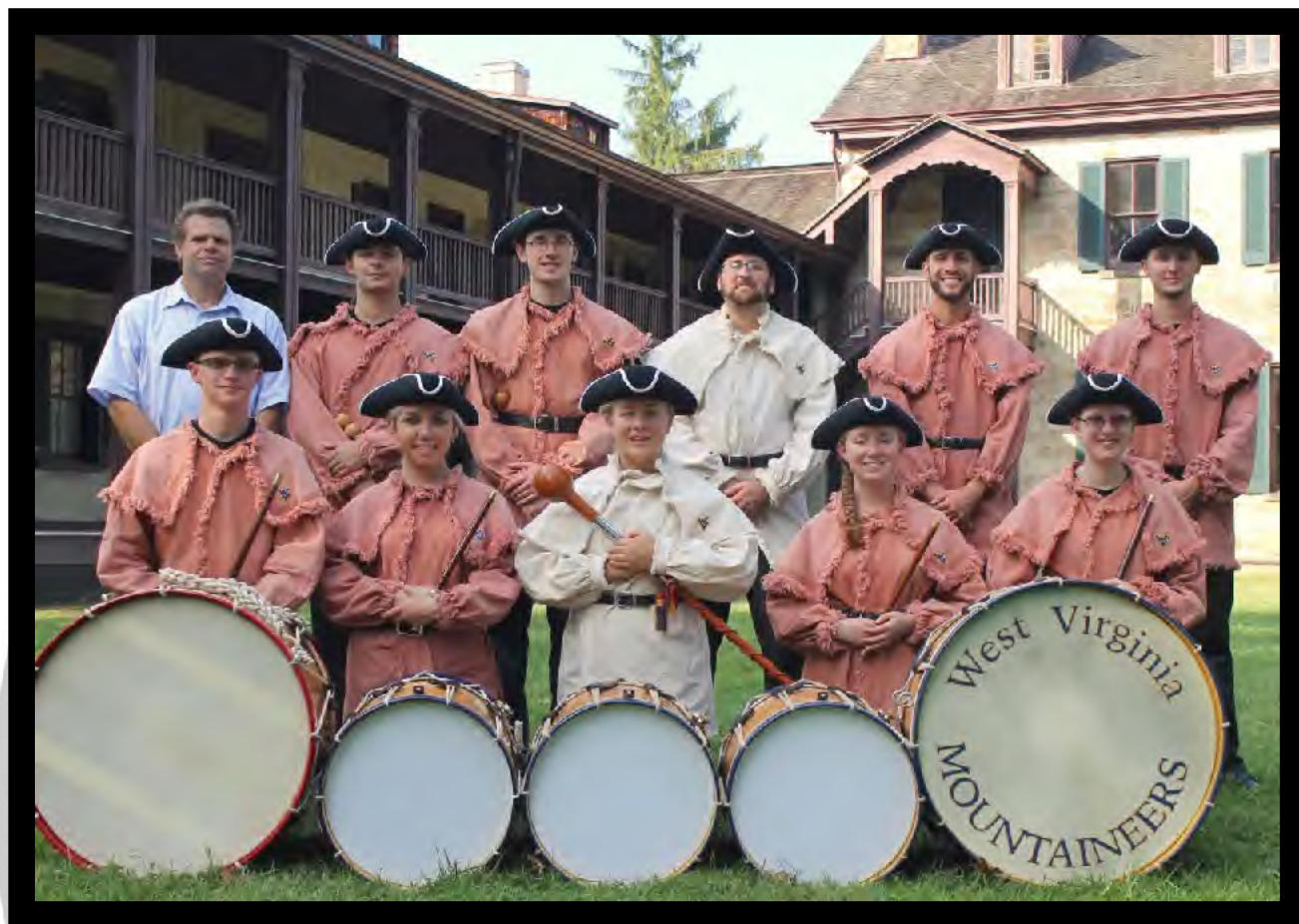
Mountaineer Fifes & Drums, Friendship Hill NHS, Port Marion, PA Friendship Hill NHS is 16.3 miles (27 minutes) from Uniontown, PA