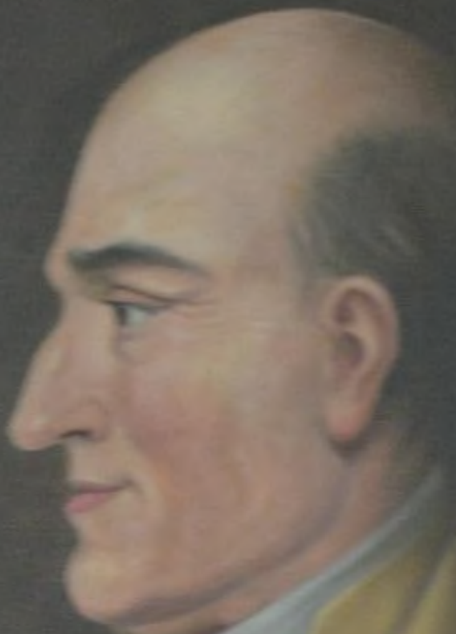
General Edward Hand