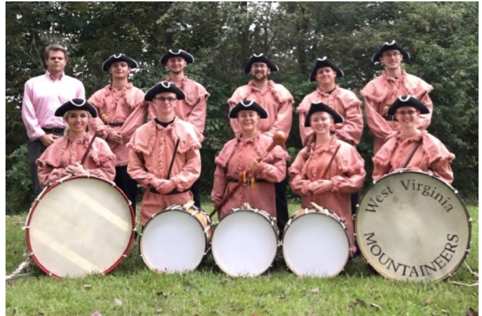
WVU Mountaineer Fife & Drum Corps

https://www.youtube.com/watch?v=ts6q7buCdSU >