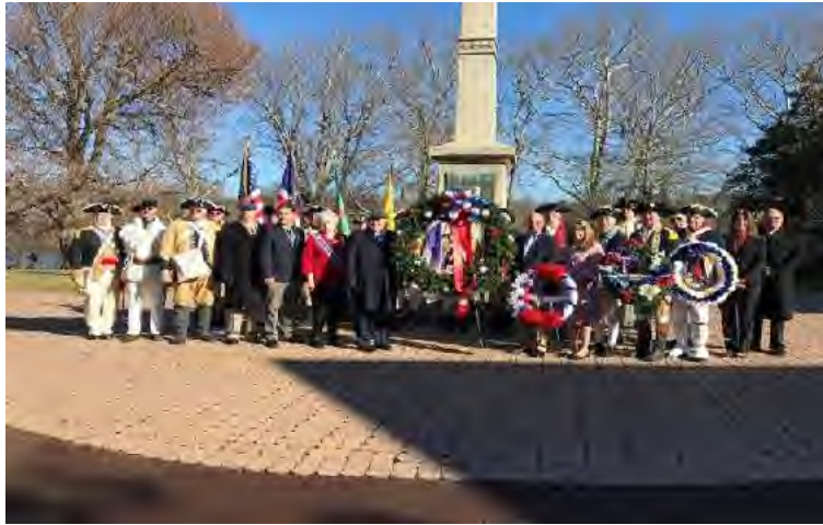
(Wreath Laying Ceremony at Washington Crossing Historic Park)