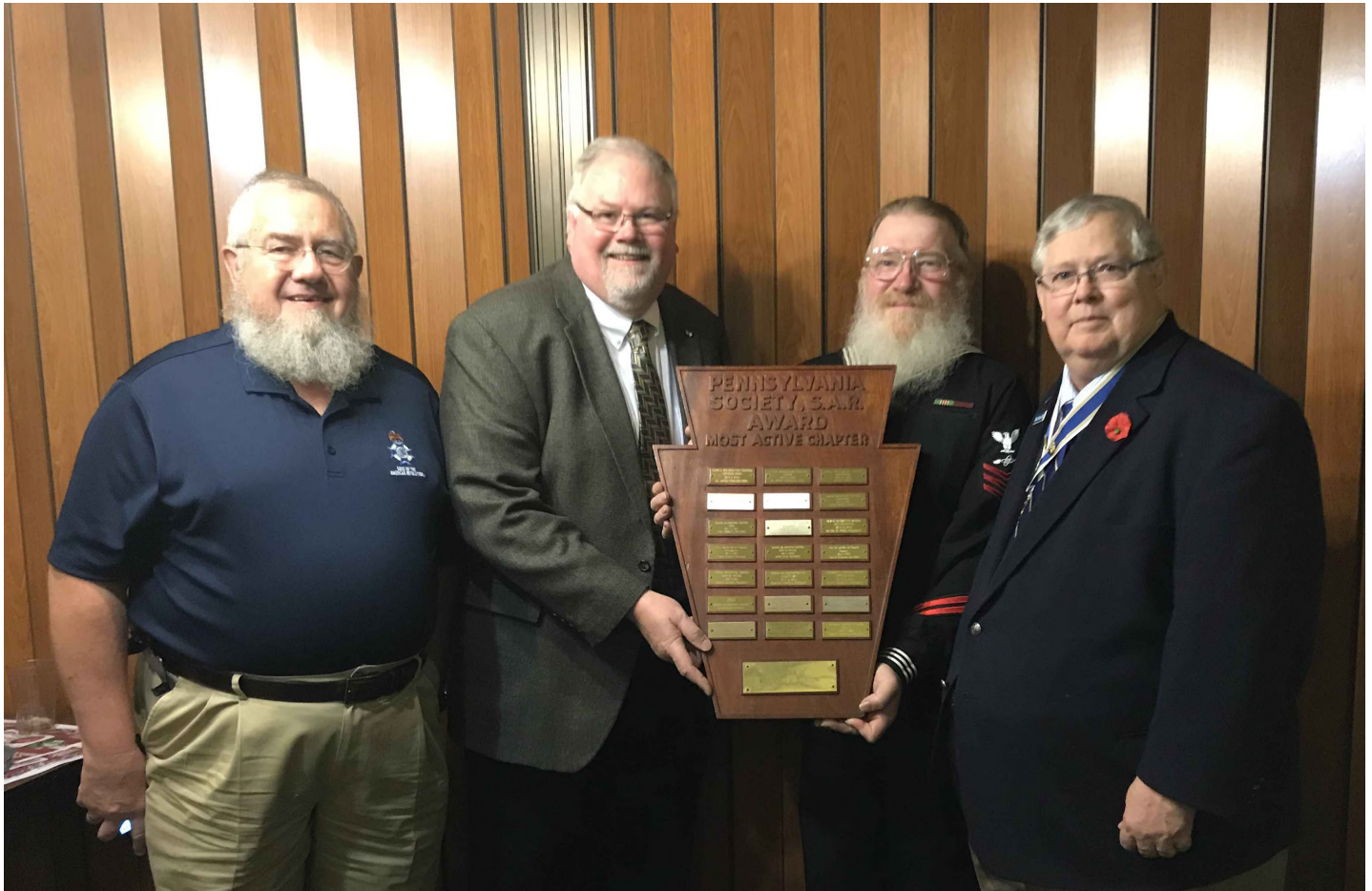
General Arthur St. Clair Chapter wins PASSAR Keystone Plaque

News of the Pennsylvania Society Sons of the American Revolution