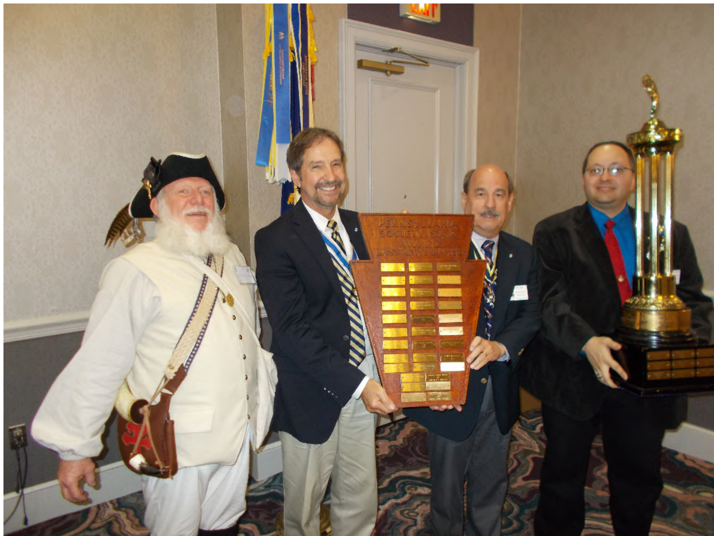
2019 PASSAR Annual Meeting – Awards Dinner